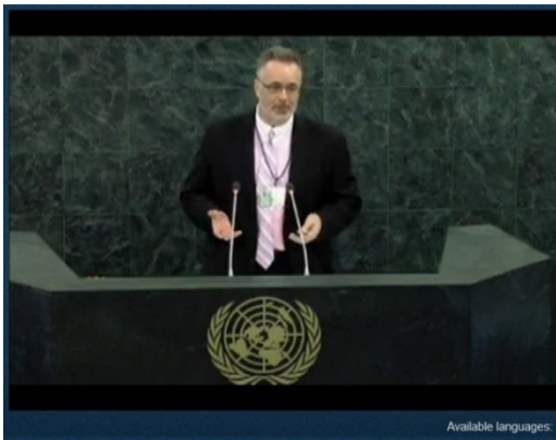
Opening of the 12th Youth Assembly at the United Nations

7 Aug 2013 - Theme: On the Road to Actions - Moving Beyond the MDGs, post 2015 Building Youth Leadership for the Success for the 8 UN Millennium Development Goals. website